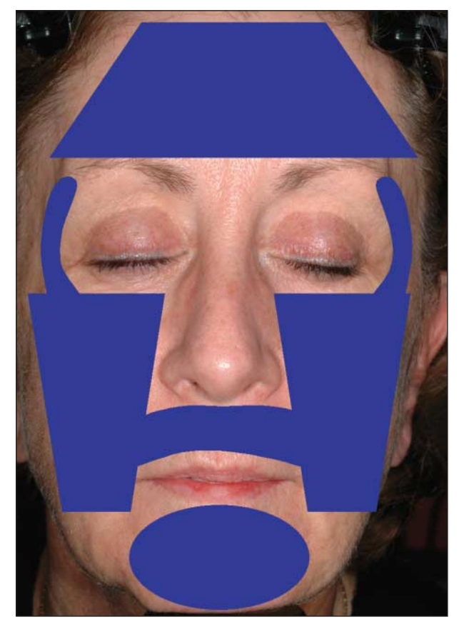
Figure 1. Zones of the face and associated treatment energy settings. Highlighted areas indicate zones treated with slightly higher-energy treatment settings vs nonhighlighted areas (1.5-1.8 J vs 1.2-1.4 J).

Patients arrived an hour before the procedure for the application of topical anesthesia without occlusion or prior skin preparation (LMX-5; Ferndale Laboratories, Inc, Ferndale, Mich). Oral analgesia (1 combination tablet of hydrocodone, 7.5 mg, and acetaminophen, 750 mg; or 1 combination tablet of propoxyphene, 100 mg, and acetaminophen, 650 mg) was administered 30 to 45 minutes before the procedure. Before each subsequent treatment, the degree of overall facial rejuvenation and rhytid improvement was recorded along with any adverse effects, such as scarring, persistent erythema, or edema. Photographs were taken before and 4 days after each treatment, and at the 1- and 3-month posttreatment follow-up visits (FinePix S2 Pro camera; Fujifilm, Tokyo, Japan).