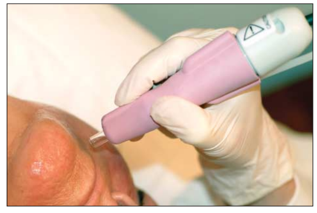
Figure 2. Plasma skin regeneration procedure performed in a paintbrush fashion, holding the handpiece approximately 5 mm from the skin surface. Immediate posttreatment erythema can be seen on the chin. There is no ablation or char formation.

Each subject's face was divided into aesthetic segments, and the topical anesthesia was removed from each segment with a dry gauze immediately before treatment of that facial zone (Figure 1). Plasma regeneration was performed 1 segment at a time until the entire face was completed in an attempt to have a constant delay time between anesthetic removal and operative start time.